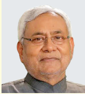
श्री नीतीश कुमार मुख्यमंत्री, बिहार